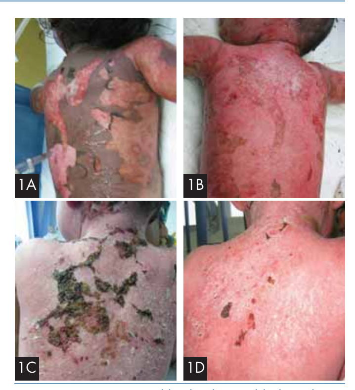
Figures 1A-1D. A 2-year-old girl with partial-thickness burns.

In total, 64 children admitted to the Hospital Civil de Guadalajara in Mexico from March 2004 to March 2005 with a diagnosis of superficial-partial, deep-partial, and full-thickness thermal injuries to the skin have entered the study. Retrospective analysis of paired cases presenting similar burns at that institution during 2003 was undertaken for the control group. The objective of the present study was to evaluate the