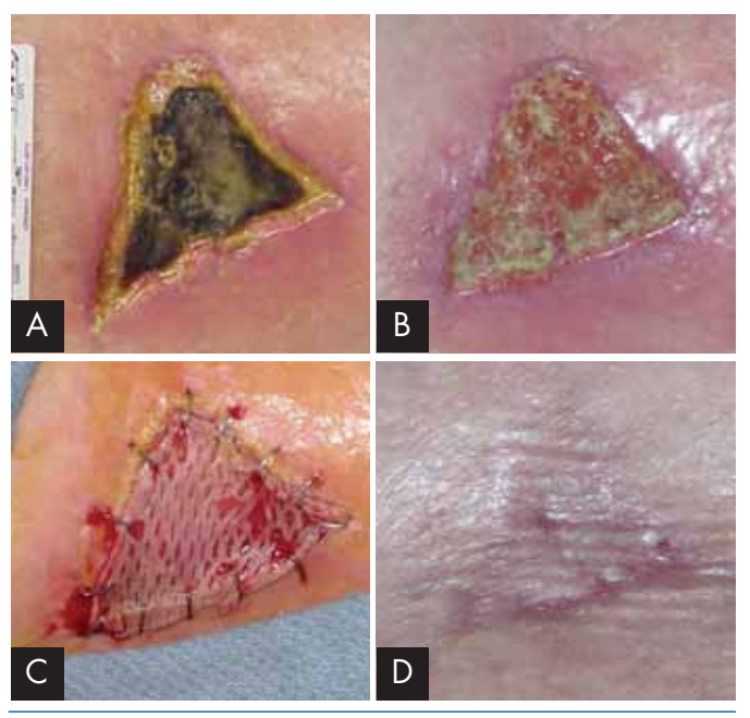
Figures 2A–2D: Leg wound at presentation (A), 2 weeks after Dermacyn use (B), after skin graft (C), and once it completely healed (D).

Patients with Integra placed in their wounds. Integra Bilayer Matrix Wound Dressing acts as a dermal matrix to help form the dermal layer of skin. It can become ineffective if it becomes infected. In 2 patients, the author soaked Integra in Dermacyn in the operating room prior to placement on the patient. Soaking Integra in Dermacyn may decrease the incidence of infection of Integra in the post-op period.