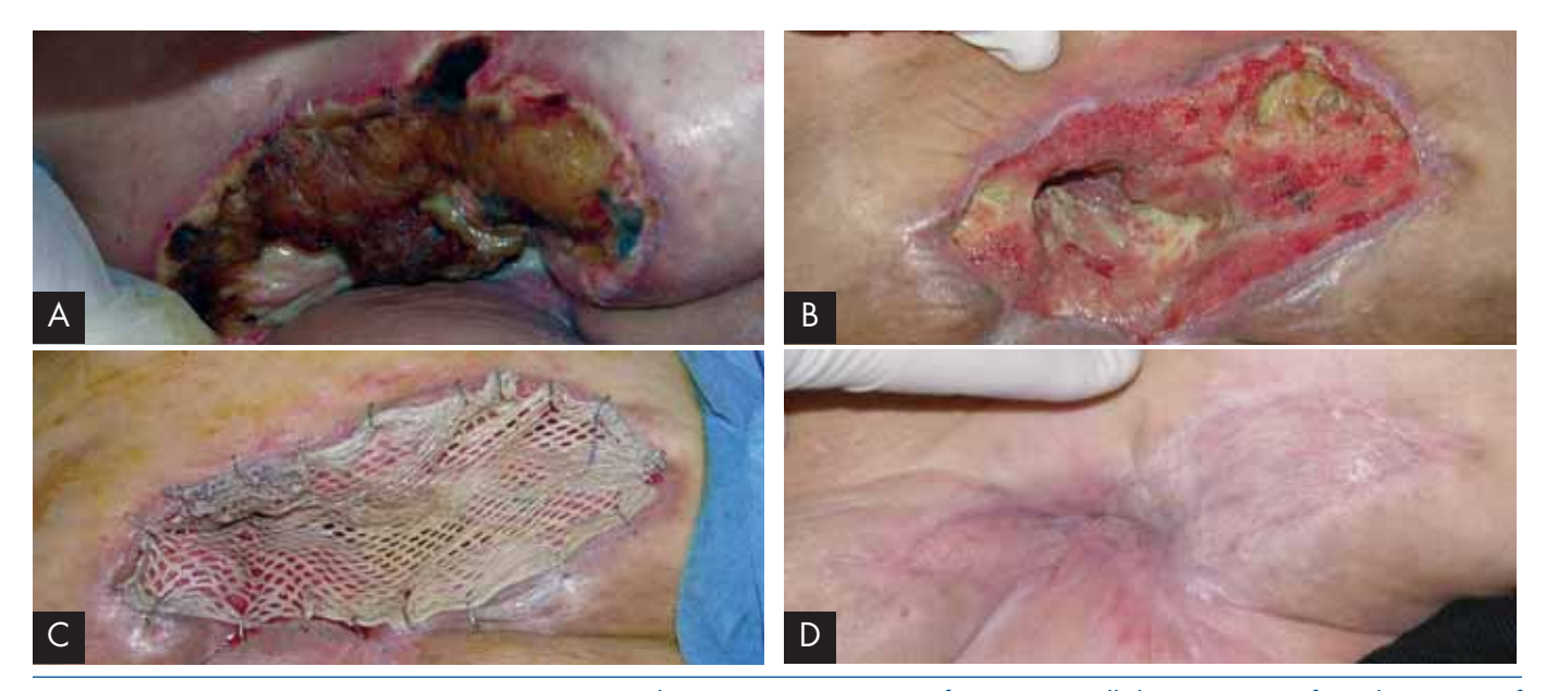
Figures 1A–D: Patient's wound at presentation (A), after VAC Instill therapy, (B), after placement of split-thickness graft (C), and the wound once it healed (D).

using Dermacyn for 2 weeks. Vacuum-assisted closure was started pre-op in preparation for a skin graft. Figure 2C shows the operative picture of the split-thickness skin graft. The patient was discharged the day of her skin graft surgery using VAC Therapy to bolster the graft. Figure 2D shows the healed wound at a post-op visit.