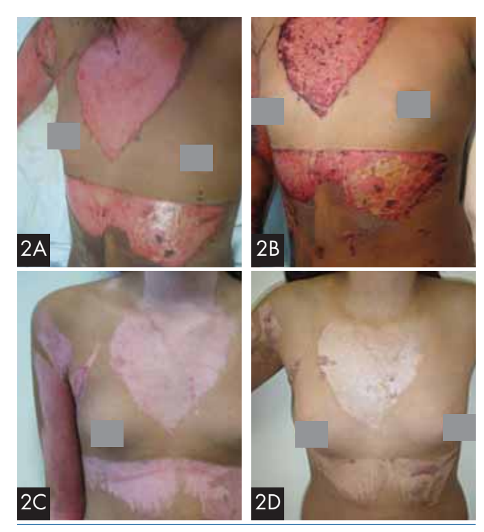
Figures 2A–2D. A 12-year-old girl with partial- and full-thickness burns.